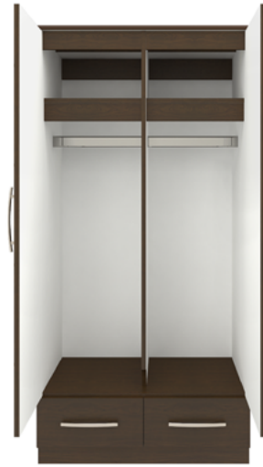
Model: HLALZ 34.5W 23.75D 71H

Kwalu's Hollywood Dementia/Alzheimers Wardrobes are thoughtfully designed to support resident independence and safety. Light colored interiors help with spatial orientation. Features include softly rounded edges and waterfall detailing. Hidden door latches and passive locks allow caregivers exclusive access. Choose from dozens of hardware styles, including ADA-compliant.